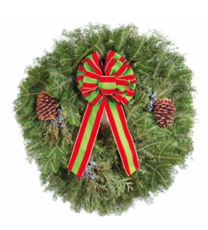
LAKE SUPERIOR WREATH