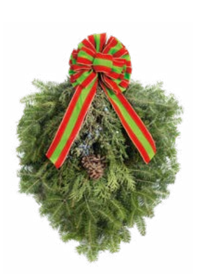
LAKE SUPERIOR SWAG